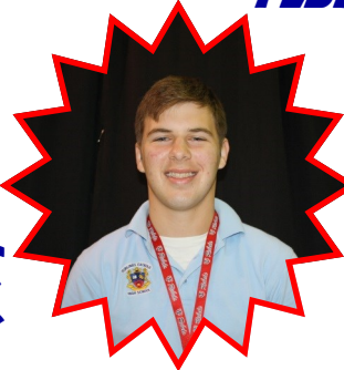
Soccer, Beta Club, National Honor Society