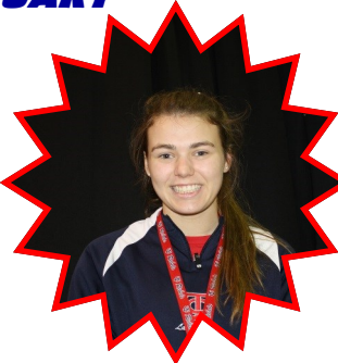
Volleyball, Basketball, Key Club, Student Council, Rebel Ambassadors