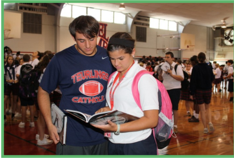
Distribution of the 2010-2011 TCH yearbooks.

*** If you did not receive the inside pages of this newsletter, please pick up a copy in the front office or visit www.tchs.net . ***