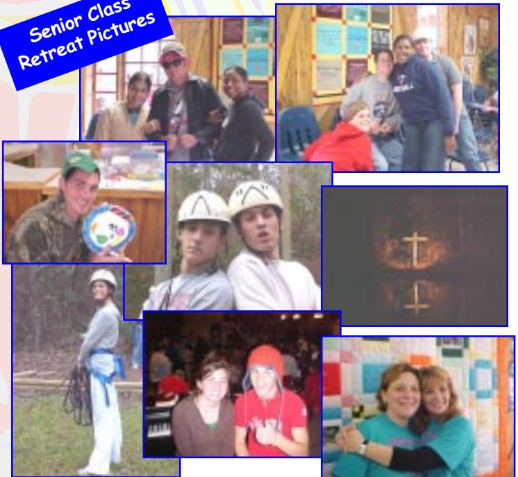
Senior Class Retreat Pictures