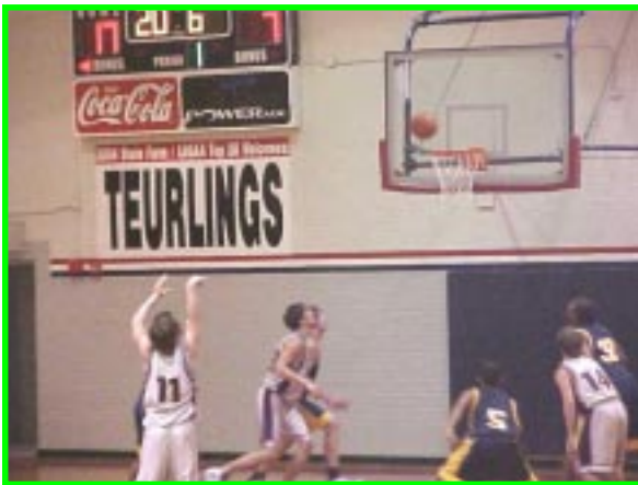
Basketball Pictures 12/14/05

139 Teurlings Drive Lafayette, Louisiana 70501