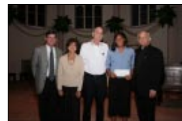
Roddy Richard Memorial Award Presentation