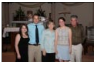
Jenni B. Schexnailder Memorial Award Presentation