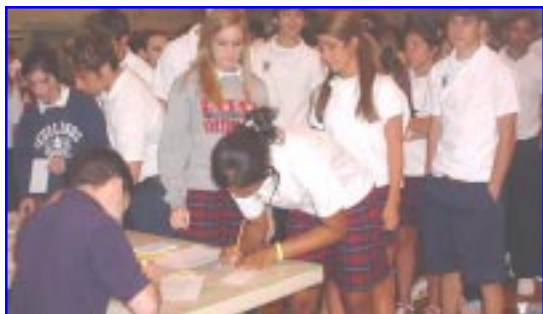
Students lined up to vote for their favorite candidates for next year's Student Council Executive Board.