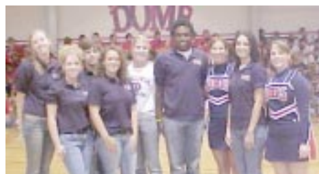
Student Council Exective Board