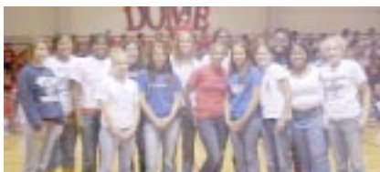
Girls Basketball Team