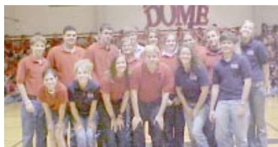
Speech & Debate