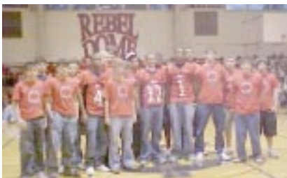
Boys Basketball Team