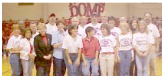
Teurlings All Sports Club