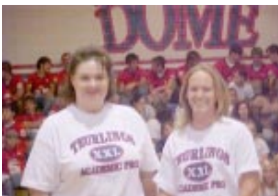
Foreign Language Dept.