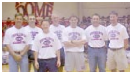
Physical Education Dept.