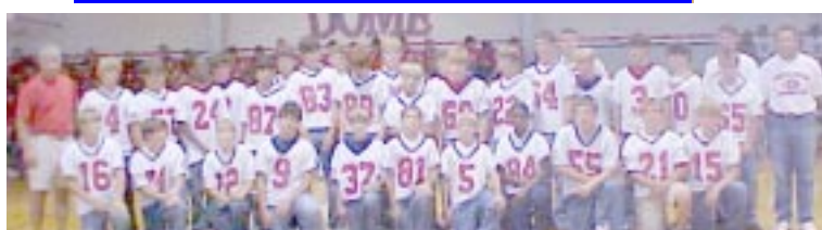
Frosh. Football Team