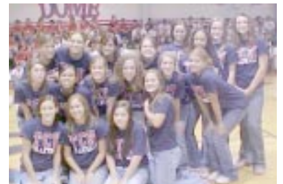
JV Volleyball Team