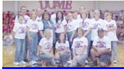
Administration & Staff