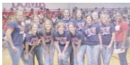
Frosh. Volleyball Team