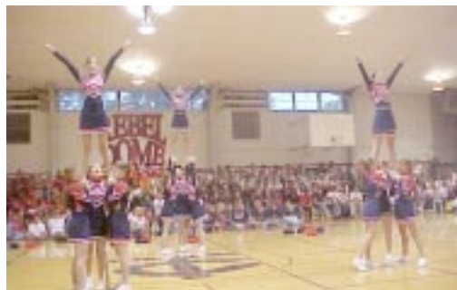
Junior Varsity Cheerleaders