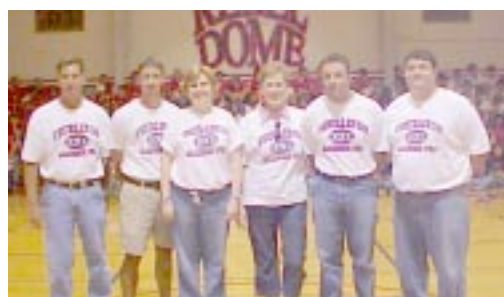
Social Studies Dept.