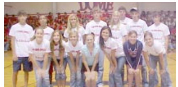
Cross Country Dept.