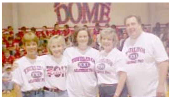
Rebel Academic Backers Club