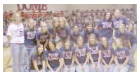
Varsity Volleyball Team