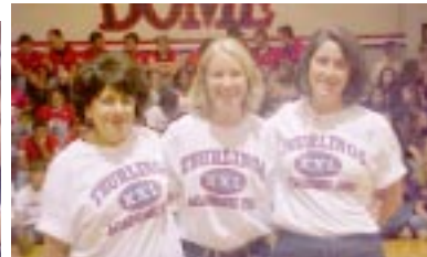
Fine Arts Dept.